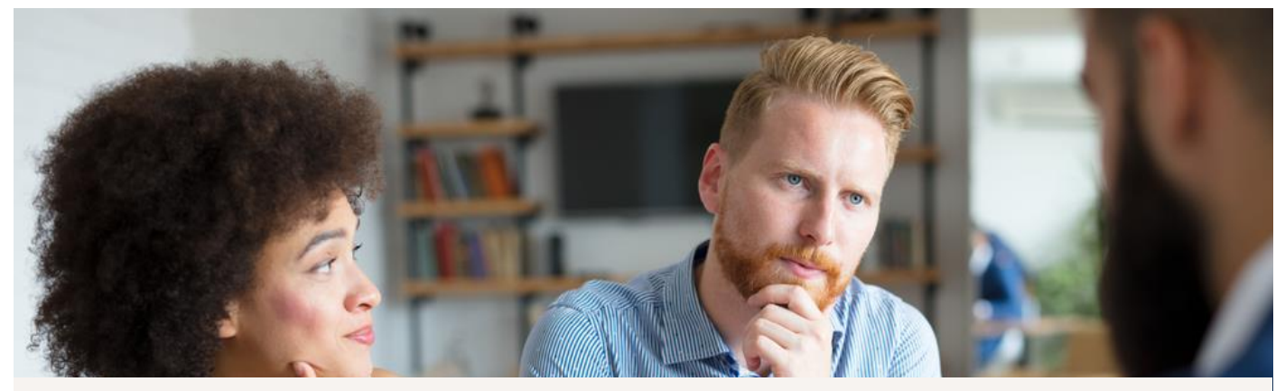
Face-to-face Accelerated Route to Membership International Arbitration